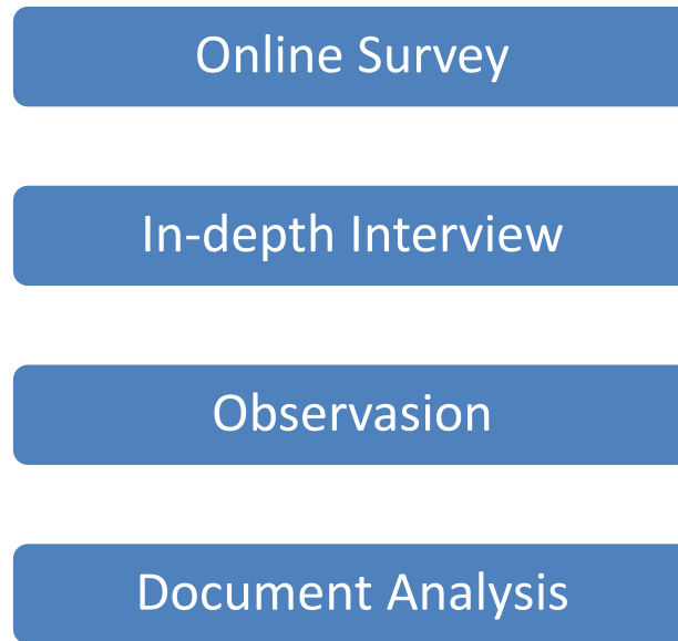
Fig 1. Research Method

1. Online Survey: An online survey will be conducted among TikTok users to gather quantitative data on their perceptions of marketing content on the platform.